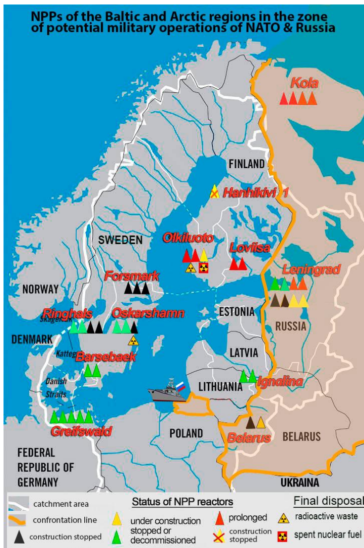
Picture 2. Baltic Arctic nuclear confrontation line of NATO and Russia

I believe that this is also a signal for 95 million inhabitants of 9 countries of the Baltic region.